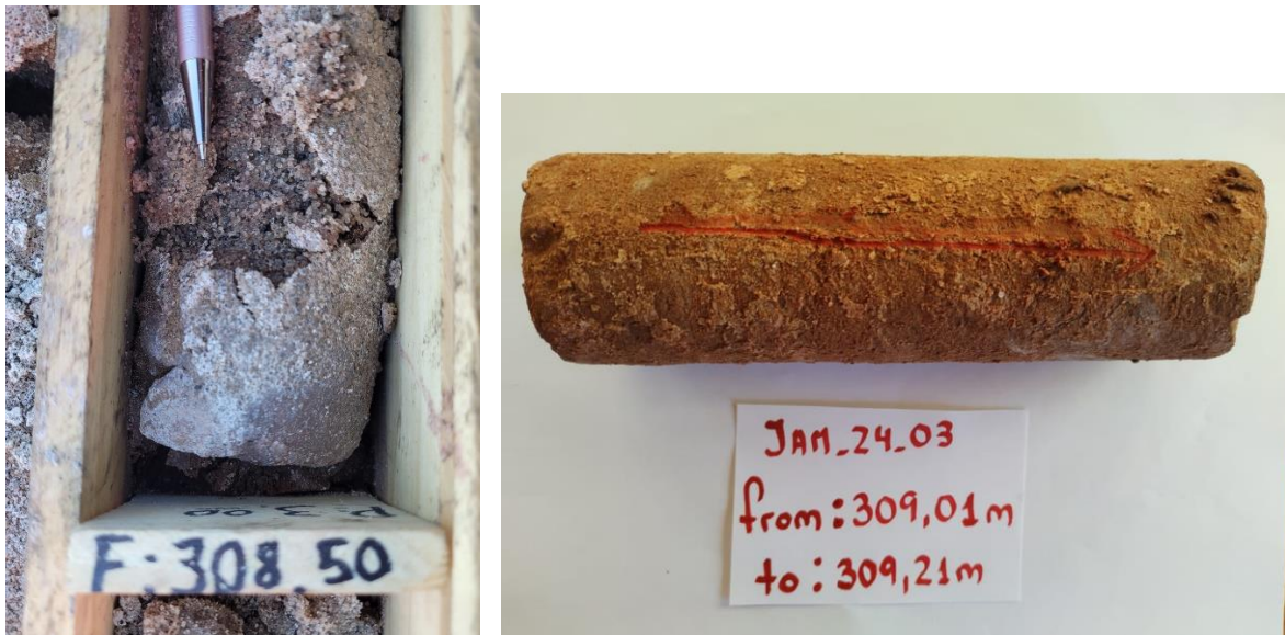
Figure 1. Core that was sent for porosity testing showing sands at 308.50m depth. Right hand side picture is core sent for testing from well JAM24-03 recently completed showing sandy matrix with gravel.

All three wells have been lined with 4 inch PVC tubing ready for NMR (nuclear magnetic resonance) porosity and permeability logging that will be undertaken when all four wells are completed.